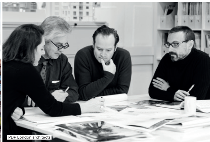
PDP London architects