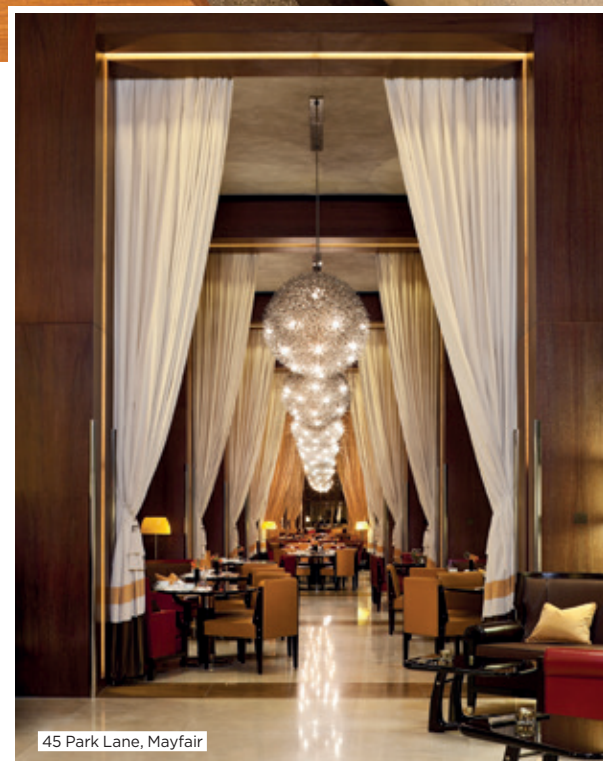
45 Park Lane, Mayfair

From designing exquisite hotels like 45 Park Lane to carefully crafting the jewel-like Barrows of Covent Garden market, from the splendour and craftsmanship of the Chelsea renaissance to shaping a new, sustainable community in Belfast, PDP London's emphasis is on creating great places to live, work and play – making a real contribution to the future of the built environment surrounding us all.