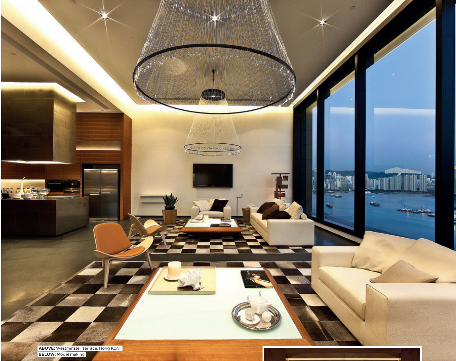
ABOVE: Westminster Terrace, Hong Kong BELOW: Model making