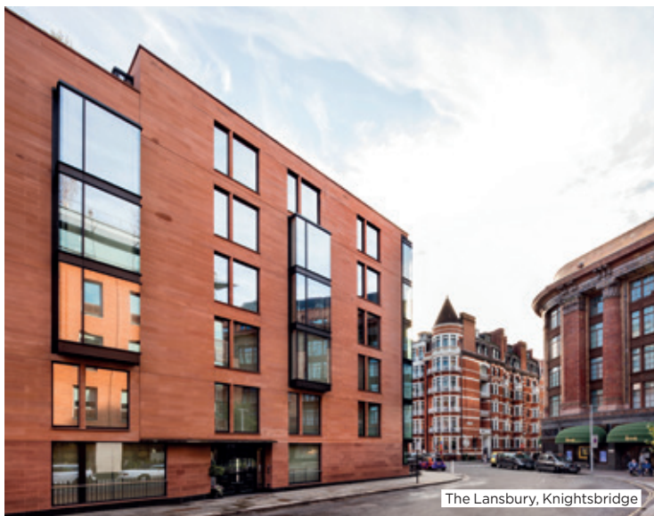
The Lansbury, Knightsbridge

PDP London is passionate about making a meaningful contribution to the public realm, the creation of places which people enjoy living in and around